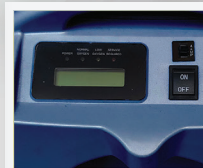
LCD Display Screen